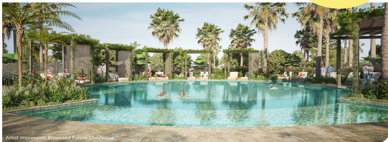
Artist Impression Proposed Future Clubhouse