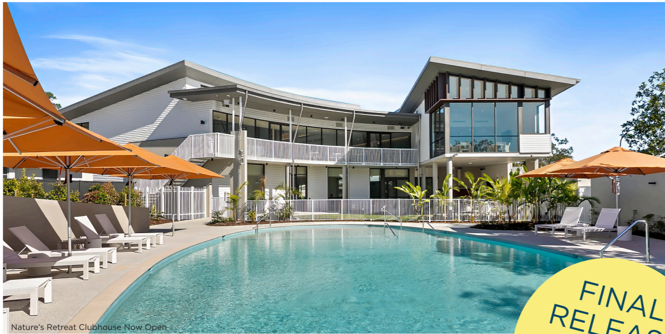
Nature's Retreat Clubhouse. Now Open