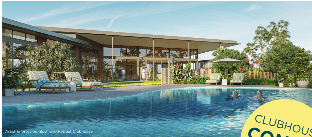
Artist Impression. Bushland Retreat Clubhouse