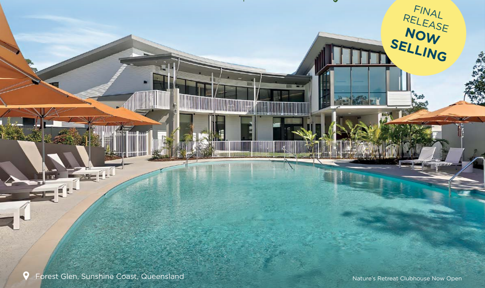
Forest Glen, Sunshine Coast, Queensland