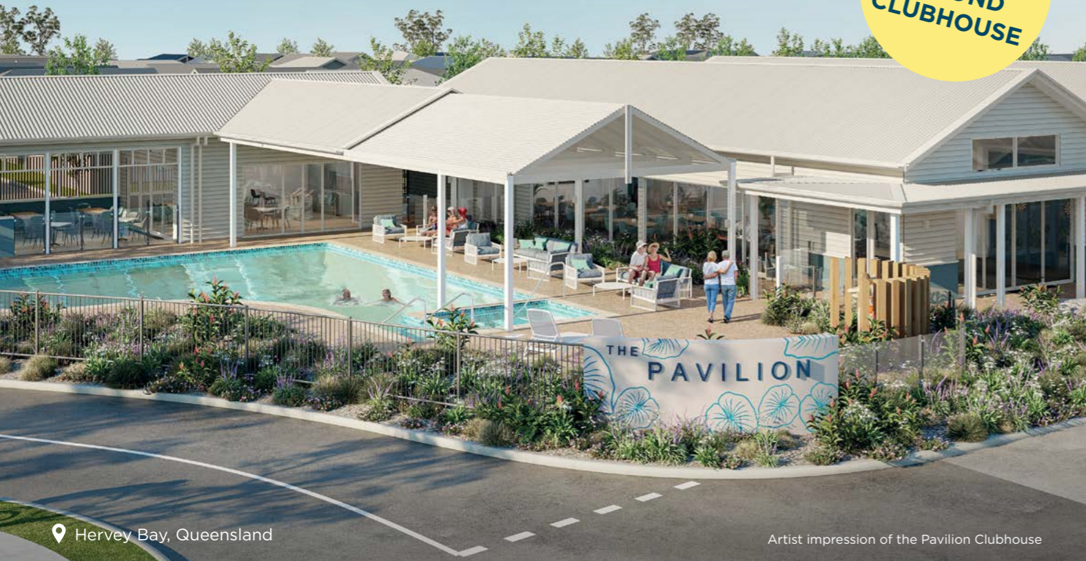
Hervey Bay, Queensland

CONSTRUCTION COMMENCED ON SECOND CLUBHOUSE