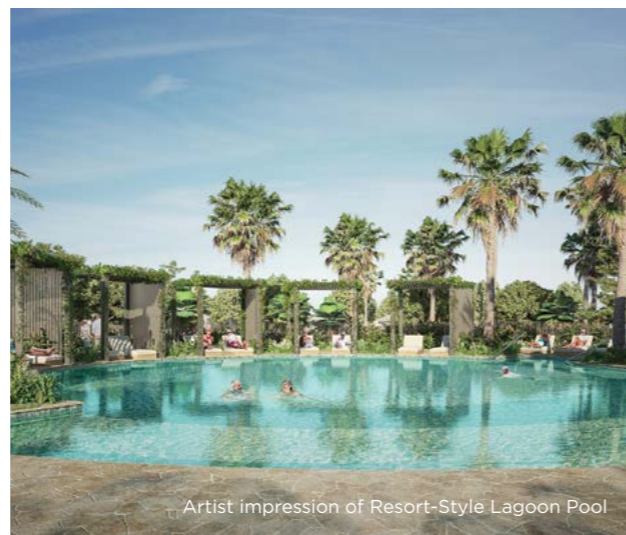
Artist impression of Resort-Style Lagoon Pool

Gracing a picturesque stretch of Queensland's stunning coastline, Drift is situated on the Coral Coast near Bargara in Bundaberg, offering convenient proximity to amenities like cafes, shops, and healthcare facilities.