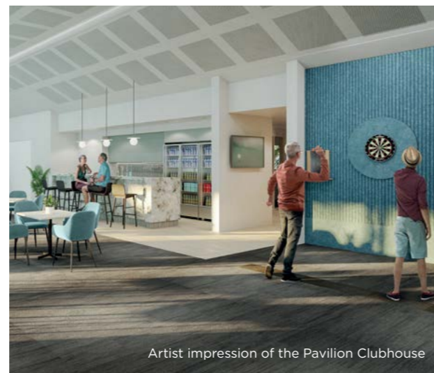
Artist impression of the Pavilion Clubhouse

With a second community clubhouse now under construction, and a range of modern homes selling, it is the perfect time to discover a new way of life.