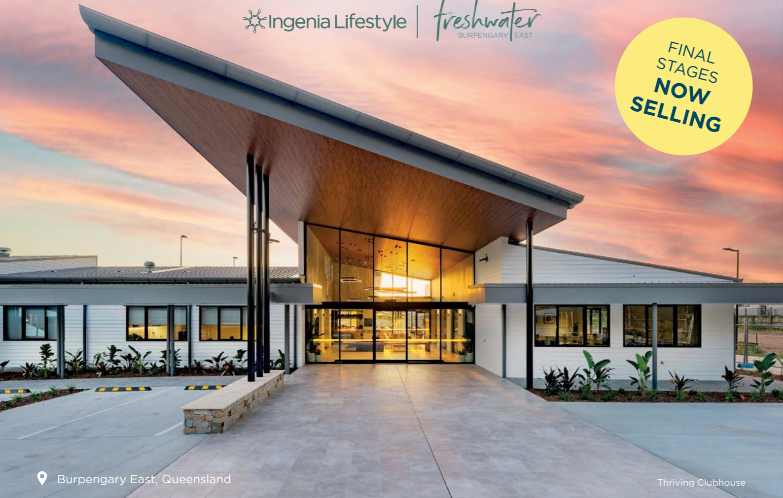
Burpengary East, Queensland