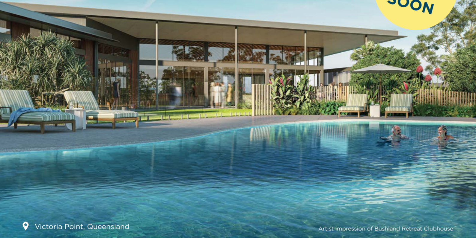
Victoria Point, Queensland